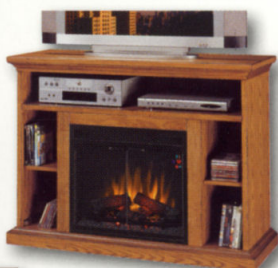
Premium Oak 23MM374-O107