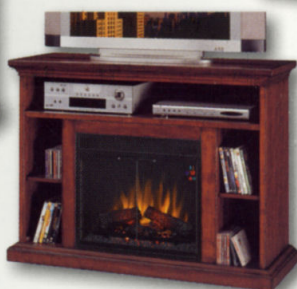
Premium Cherry 23MM374-C202