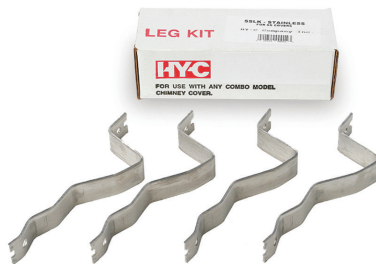
SSLK - Leg Kit